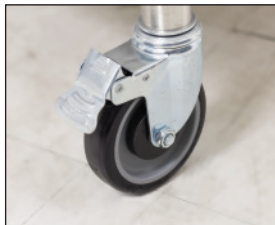
Heavy Duty Casters With Brakes On All Four Legs